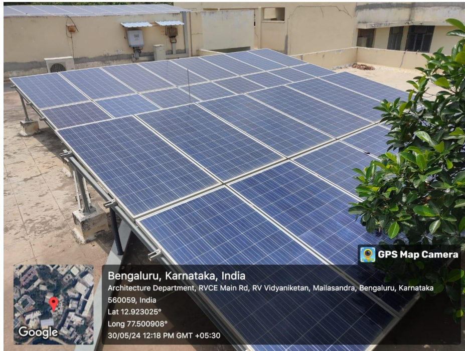
Fig: Solar Panel in Aerospace dept