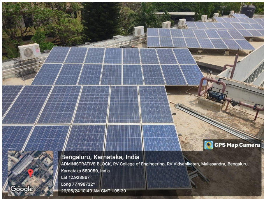
Fig: Solar Panel in Admission block