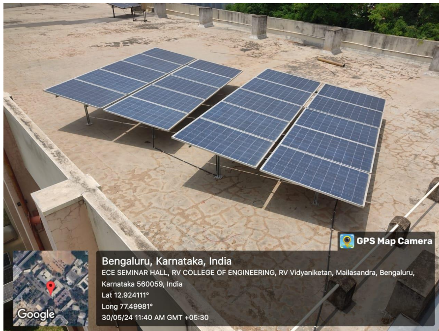
Fig: Solar Panel in Aerospace dept