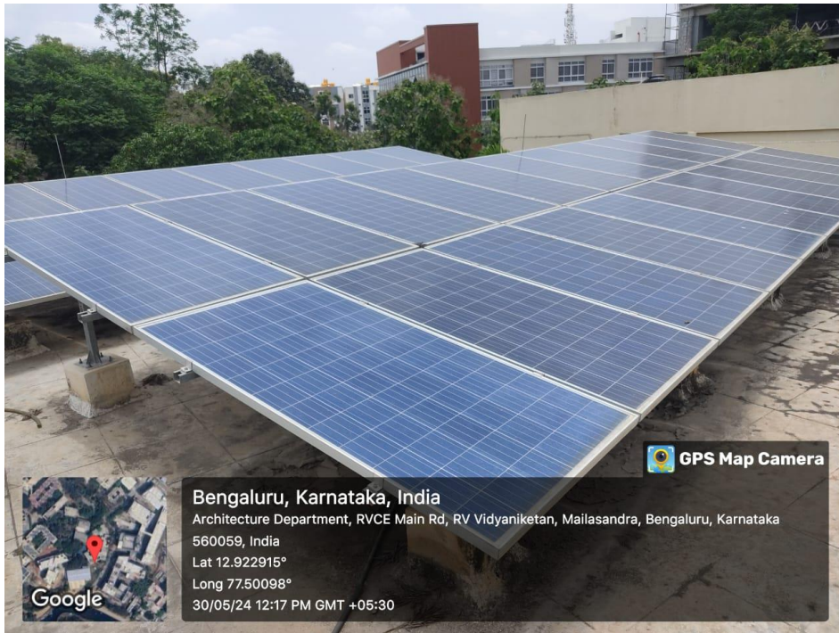
Fig: Solar Panel in Electrical dept